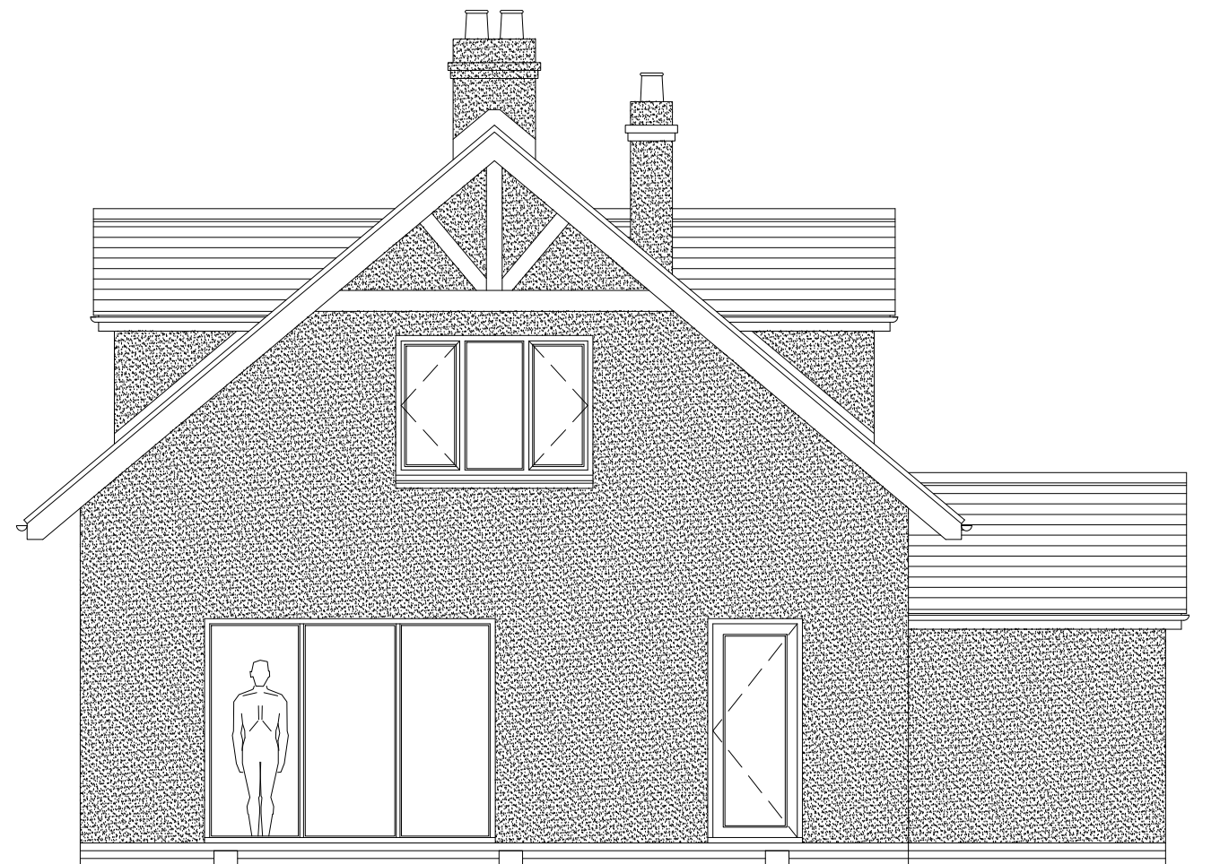
Proposed Rear (East) Elevation