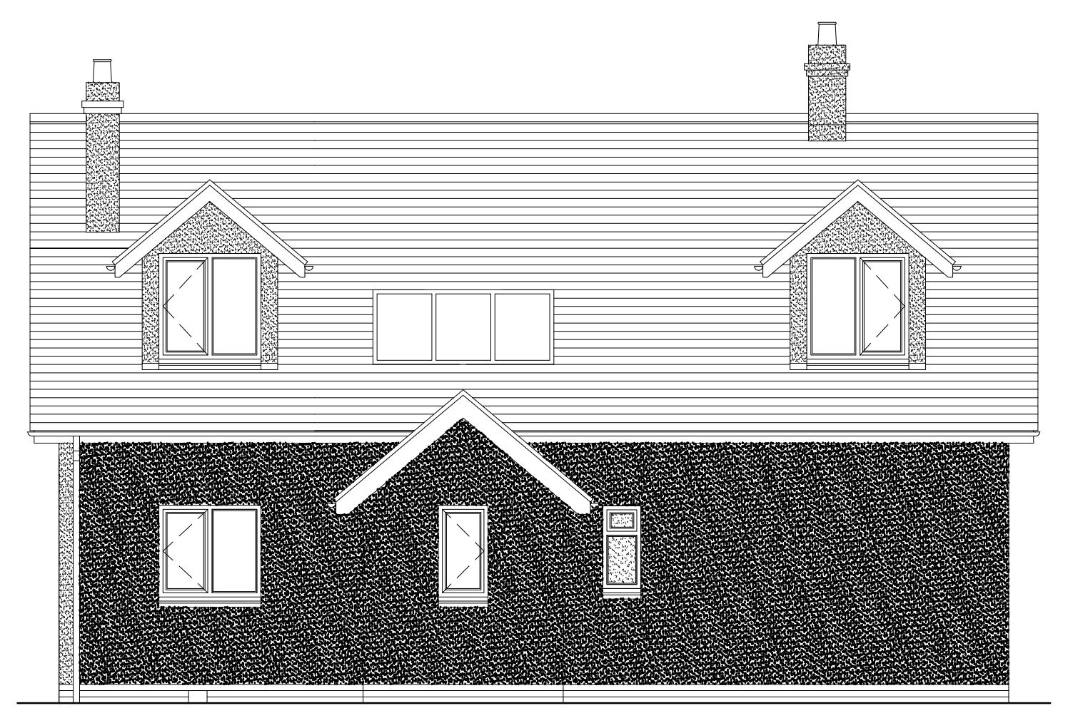
Proposed Side (North) Elevation