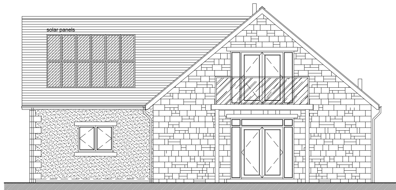
Rear (South) Elevation