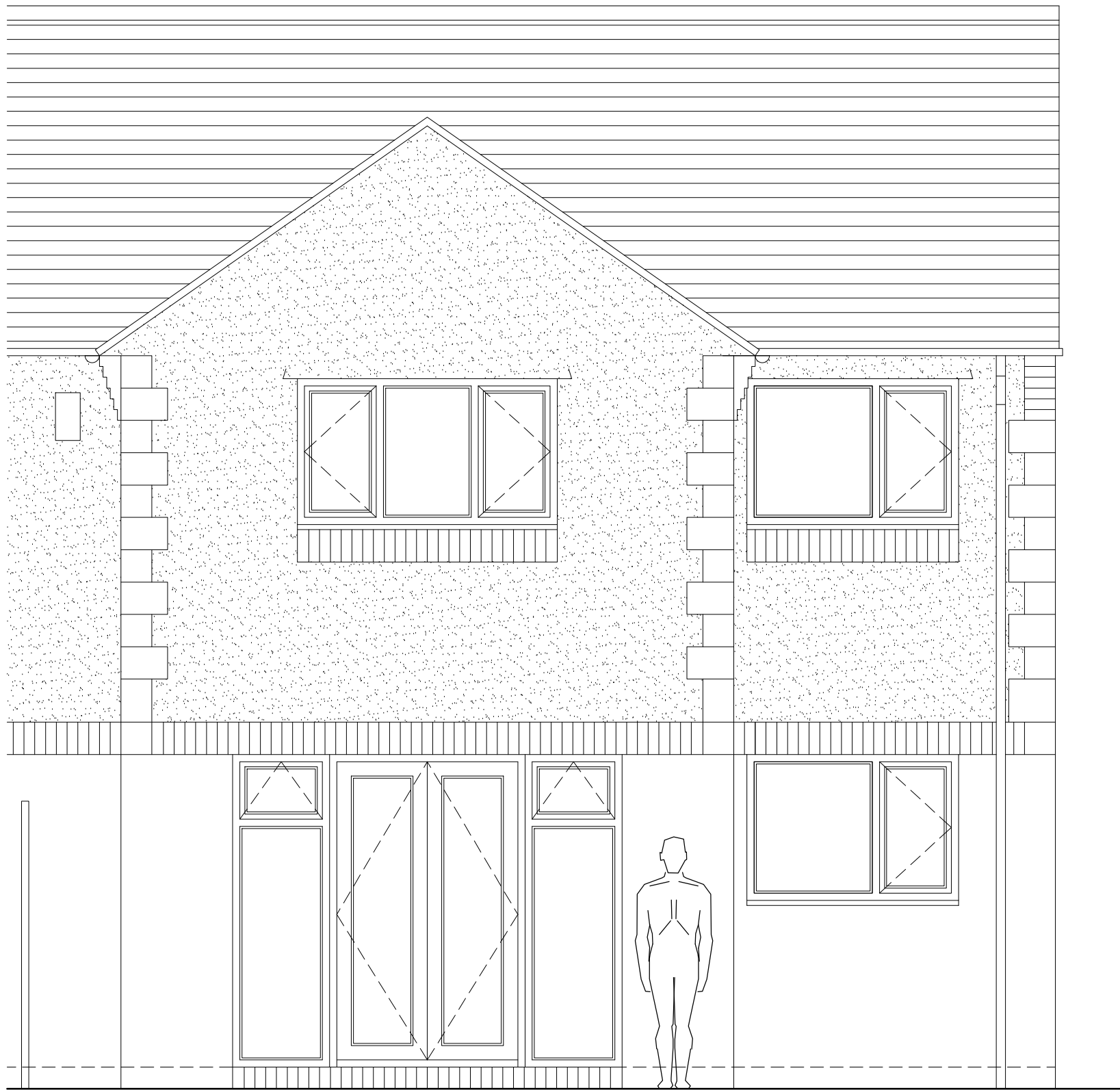
Proposed Rear (East) Elevation